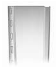
7" Board 'n Batten Vertical